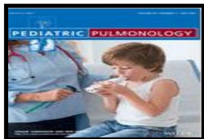
PEDIATRIC PULMONOLOGY (ACCESSIBLE ISSUES: 2017-2021)