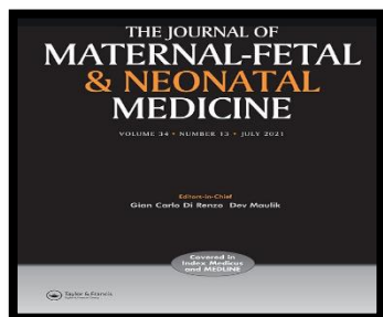
THE JOURNAL OF MATERNAL-FETAL & NEONATAL MEDICINE (ACCESSIBLE ISSUES: 1997-2021)